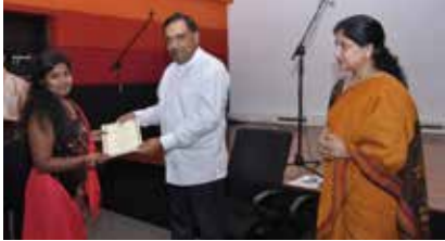
World Hindi Day His Excellency Y. K. Sinha High Commissioner of India presenting certificates