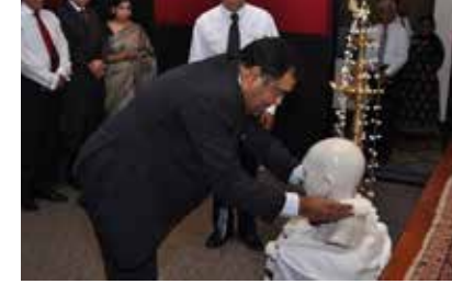
Mahatma Gandhi Oration organized by the Indian Cultural Centre in collaboration with the Sri Lanka India Society