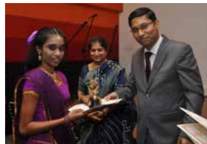
Hindi Diwas – Shri Arindam Bagchi, Deputy High Commissioner of India presenting certificates