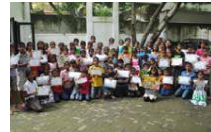
Shankar's International Children's Competition - Painting, Drawing and Essay Competition on Children's Day