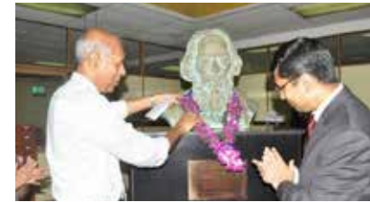
Birth Anniversary Celebrations of Gurudev Rabindranath Tagore at University of Colombo