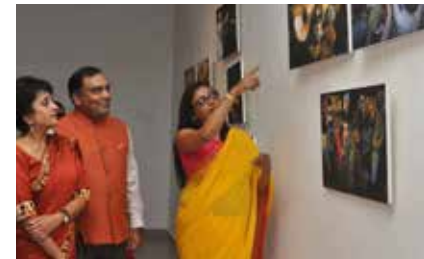
An Exhibition of Photographs "Celebrating Life with Colours" by Jayati Saha