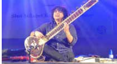
Salute: Celebrating India Concert by Shri Niladri Kumar for the Republic Day of India