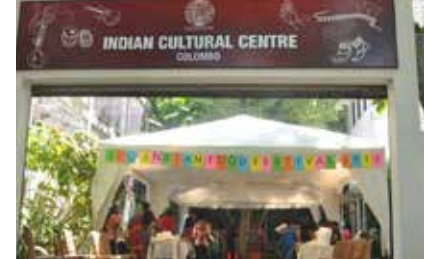
Food Festival at ICC, Colombo