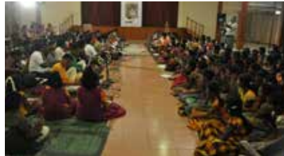
Sri Thyagaraja Aradhana – Carnatic Music Festival at Saraswathie Hall, Bambalapitiya