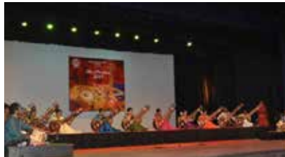
Nav Pratibha 2015 – Annual Dance and Music Concert by the students of Indian Cultural Centre