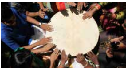
Avurudu - Sinhala and Tamil New Year Celebrations