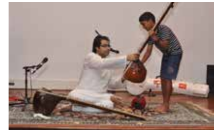
Sitar Workshop by Shri Purbayan Chatterjee