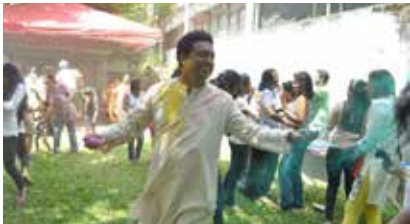
Holi Celebrations at ICC, Colombo