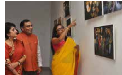
An Exhibition of Photographs "Celebrating Life with Colours by Jayati Saha