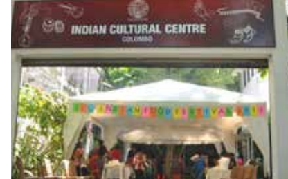
Food Festival at ICC, Colombo