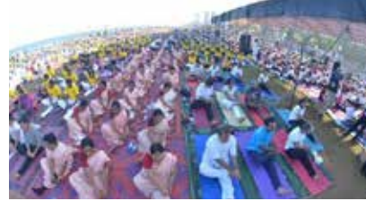
1st International Day of Yoga at Galle Face Green