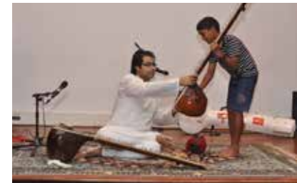
Sitar Workshop by Shri Purbayan Chatterjee