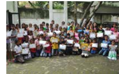
Shankar's International Children's Competition - Painting, Drawing and Essay Competition on Children's Day