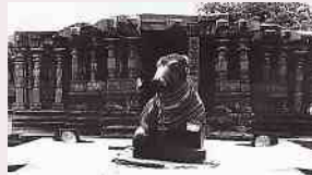
Nandi bull guarding the 1000-pillared Temple

The Archeological Survey of India dug out some buried remnants of a magnificent structure – apparently belonging to an annihilated temple dedicated to another Kakatiyan deity – Swayam Bhudevi (temple to the Mother earth). It is led by four impressive gateways known as Keerti Toranalu , or the victory arches, standing majestically in four cardinal directions. They are said to have been built by King Ganapati Deva to mark the victory of Princess Rudramma Devi over the Yadav kings of Bidar. Each of these arches is a masterpiece of classic Kakatiyan art; they are known for their remarkable symmetry and intricate carvings.